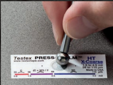
For use with Testex™ Press-O-Film™ Replica Tape

Measures and records surface profile parameters using replica tape