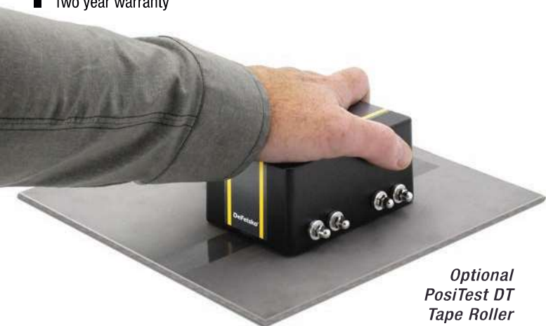
Optional PosiTest DT Tape Roller

Conforms to ISO 8502-3, AS 3894.6, US Navy PPI 63101-000